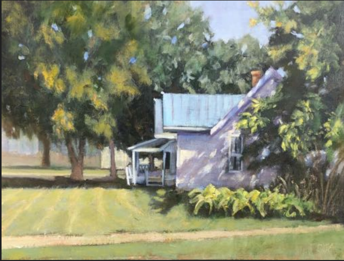
Vintage Lake Cottage