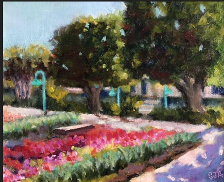
Periwinkle Shops Garden