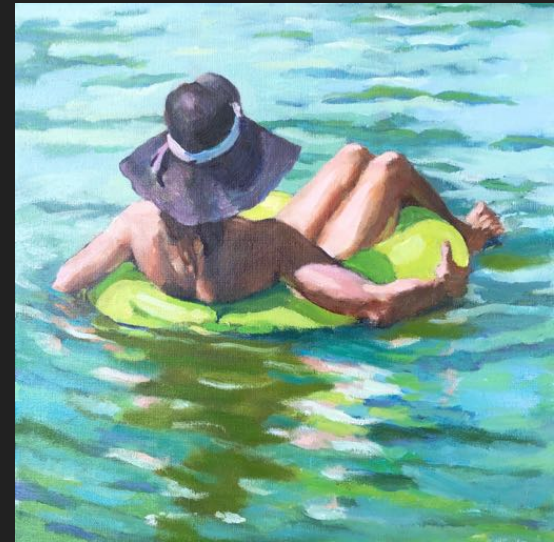
Floating in Captiva