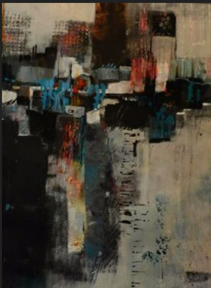
New York Minute