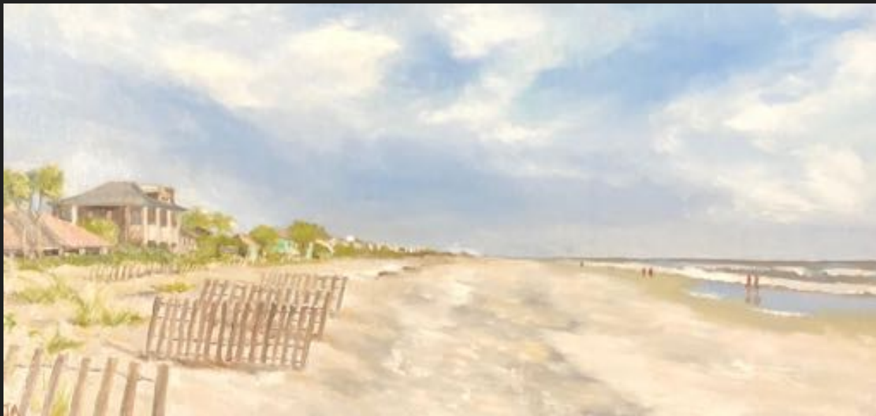
Ponte Vedra Beach