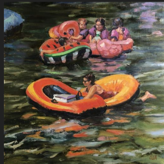
Tubing in Wisconsin