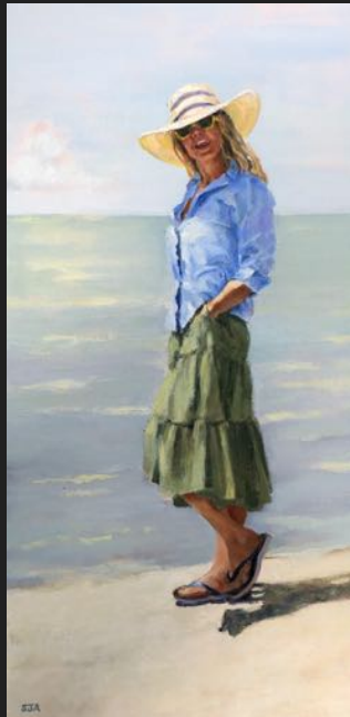
Blue 30" x 15" Oil on Canvas, Framed