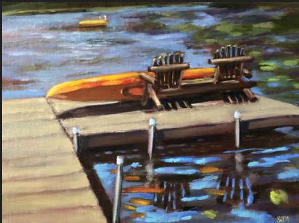
Kayak on the Dock