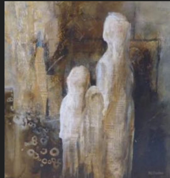
Into the light