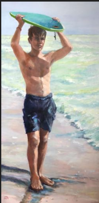
Skim at Bowman's 48" x 24" Oil on Wrapped Canvas