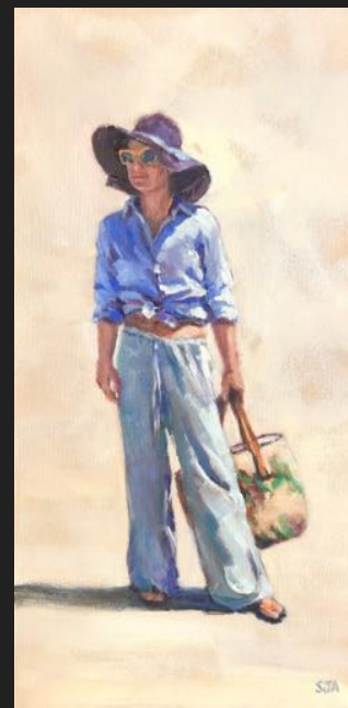
Caroline 20" x 10" , Oil on Canvas, Framed